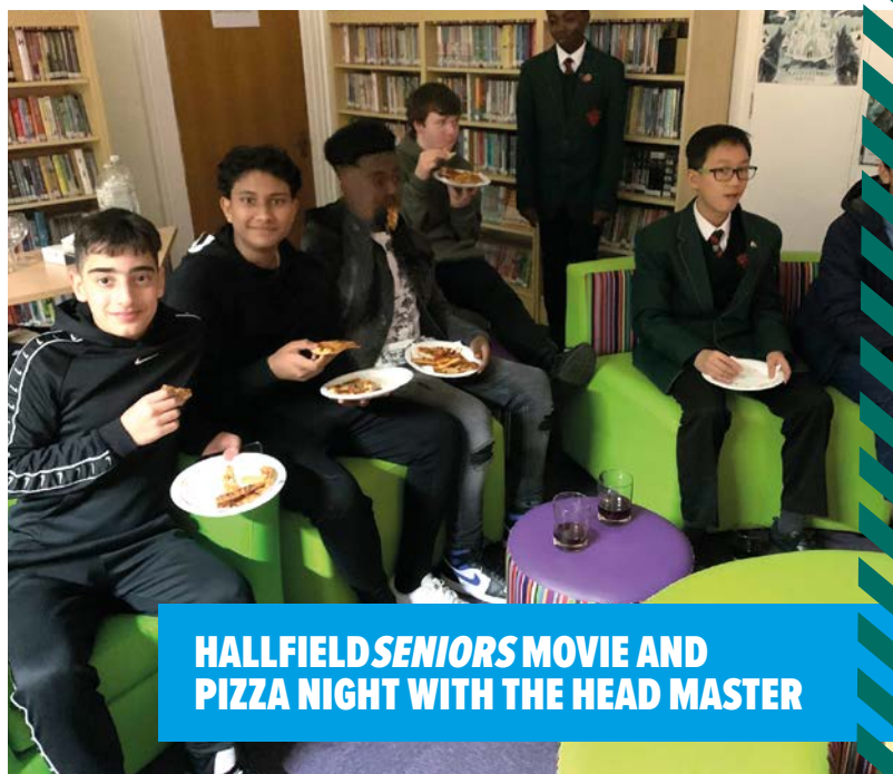
HALLFIELD SENIORS MOVIE AND PIZZA NIGHT WITH THE HEAD MASTER