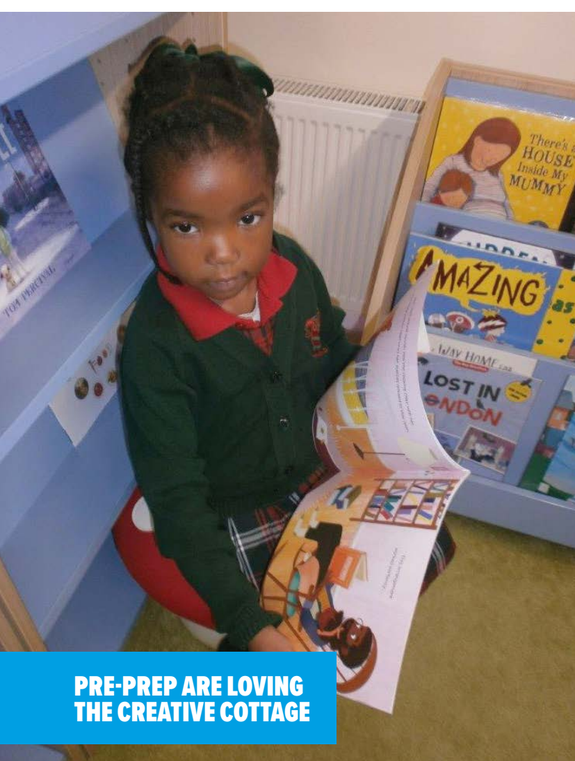
PRE-PREP ARE LOVING THE CREATIVE COTTAGE