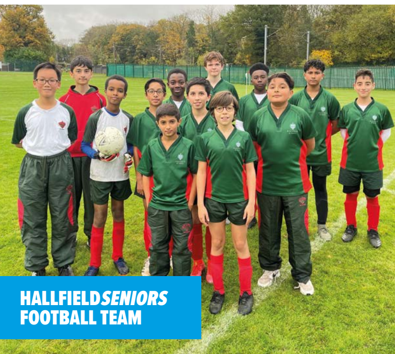
HALLFIELD SENIORS FOOTBALL TEAM