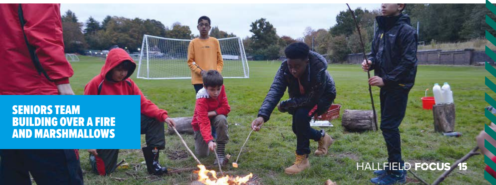
SENIORS TEAM BUILDING OVER A FIRE AND MARSHMALLOWS